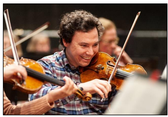
The BSO's professional musicians tour chamber music this autumn